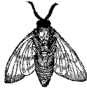
Figure 2: A sample black and white graphic that has been resized with the includegraphics command.

single-column table, this wide table will “float” to a location deemed more desirable. Immediately following this sentence is the point at which Table 2 is included in the input file; again, it is instructive to compare the placement of the table here with the table in the printed dvi output of this document.