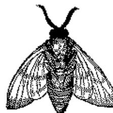
Figure 1. A sample black and white graphic (.pdf format; resized to 1.25in height).

This sample document contains examples of .eps and .ps files to be displayable with LaTeX. More details on each of these is found in the Author's Guide .